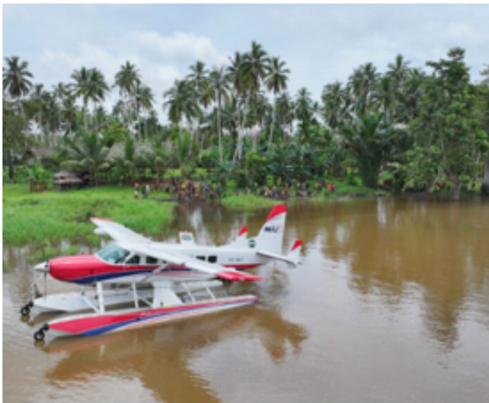
MAF's amphibious aircraft (P2-WET) on Lake Murray – Papua New Guinea's largest lake.